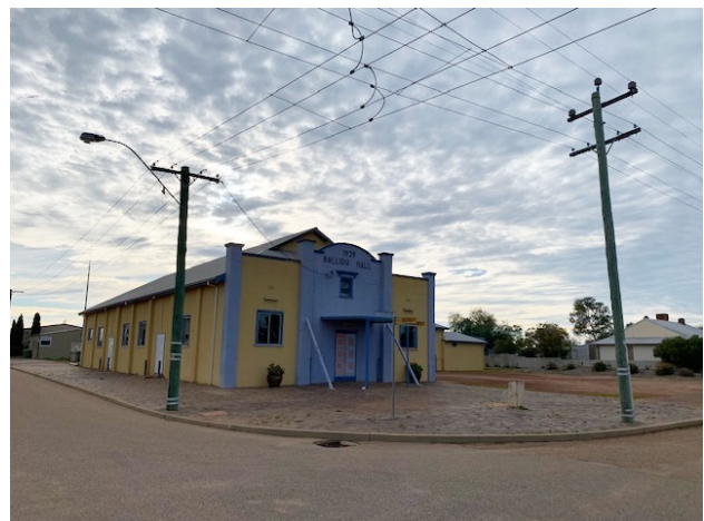
Front of Ballidu Hall Where Sign will be Placed