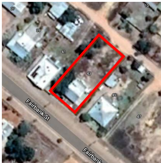
Google Maps 22/10/2020

The applicant is seeking Council's approval to terminate the lease between them and the Shire of Wongan-Ballidu. A lease between the applicant and the Shire of Wongan-Ballidu commenced on 1 January 2013 and is due to expire on 31 December 2034.