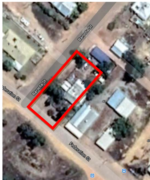
Google Maps 22/10/2020

Lot 1 Federation Street, Ballidu comprises a total area of approximately 0.1011 hectares. The property has an existing single dwelling and 6 metres x 12 metres steel Colourbond shed.