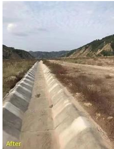
Examples of Applications