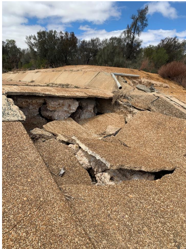
Damage to Existing Spillway